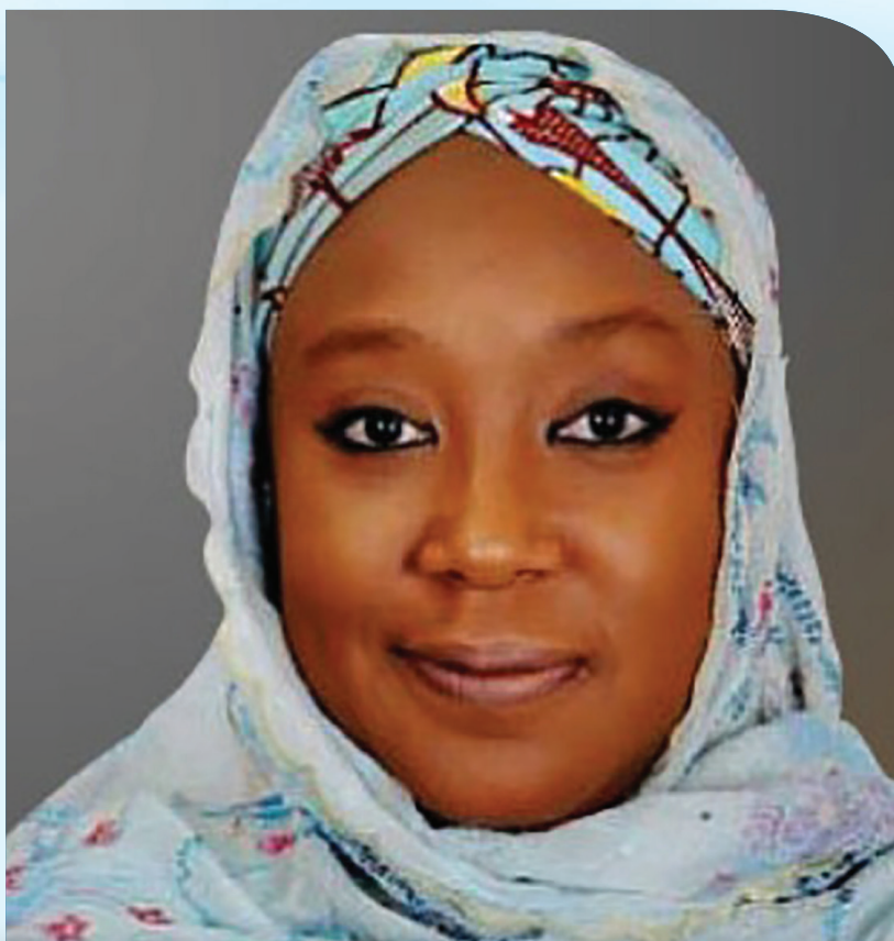
KHADIJA BUKAR ABBA IBRAHIM CHAIRPERSON, HOUSE COMMITTEE ON MARITIME, SAFETY AND EDUCATION