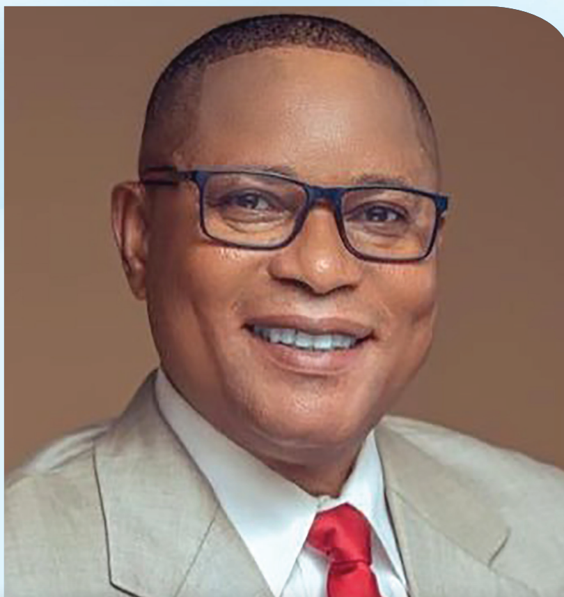
SENATOR WASIU ESHINLOKUN SANNI CHAIRMAN, SENATE COMMITTEE ON MARINE TRANSPORT