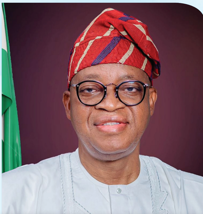
HIS EXCELLENCY, ADEGBOYEGA OYETOLA, CON HONOURABLE MINISTER OF MARINE AND BLUE ECONOMY FEDERAL REPUBLIC OF NIGERIA