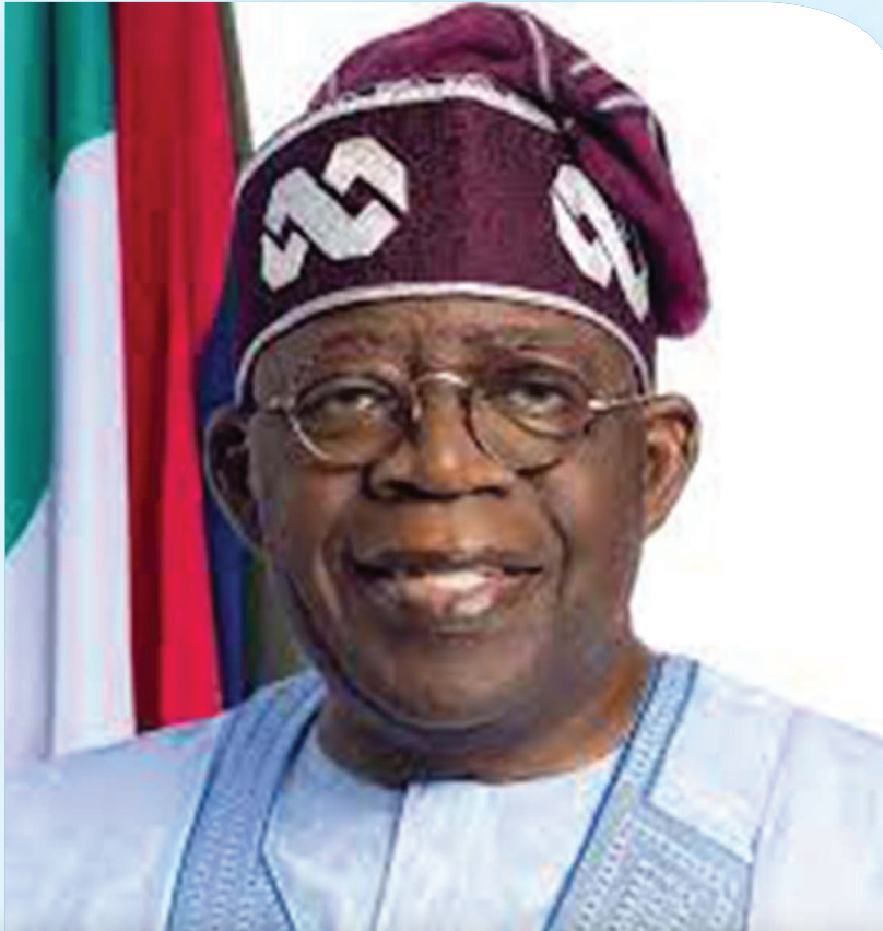
HIS EXCELLENCY, PRESIDENT BOLA AHMED TINUBU , GCFR COMMANDER-IN-CHIEF OF THE ARMED FORCES OF THE FEDERAL REPUBLIC OF NIGERIA