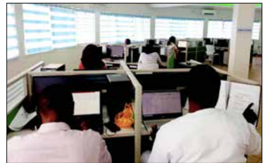
NIMASA library users