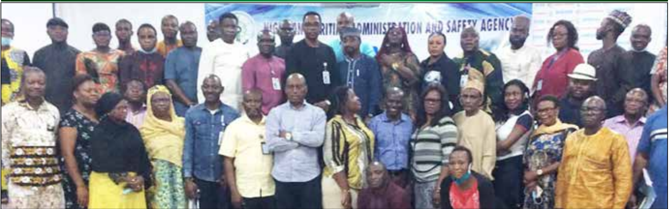
Participants at the PRDMSD Workshop