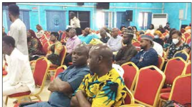
Cross section of participants at the workshop