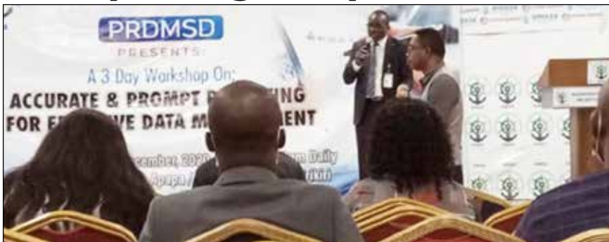
Participants at the three-day workshop on harmonisation of the reporting organised by the Planning, Research and Data Management Services (PRDMS) Department

T he Planning, Research and Data Management Services (PRDMS) Department of the Agency held a three-day workshop, December 2 – 4, on harmonisation of the reporting system. The venue was the Nigerian Maritime Resource Development Centre (NMRDC), Kirikiri. The workshop sought to improve responsiveness to the Agency, maritime stakeholders, and publics in the area of research through more effective and efficient data gathering, analysis, and retrieval.