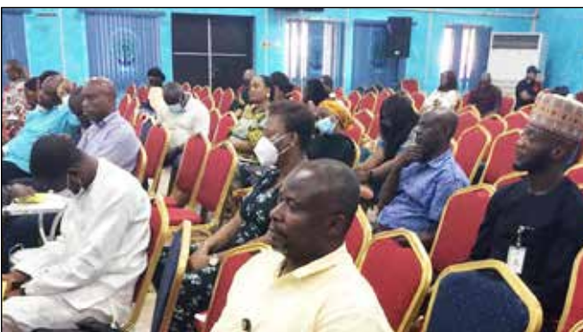
Cross section of participants at the workshop